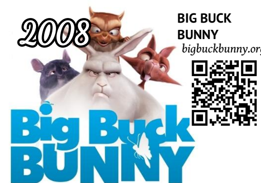
BIG BUCK BUNNY bigbuckbunny.org