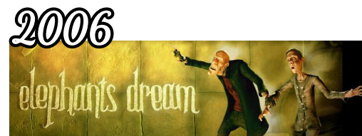
ELEPHANT'S DREAM elephantsdream.org